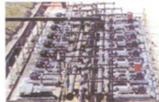
6D series pumps in crude oil service - Pacific Rim