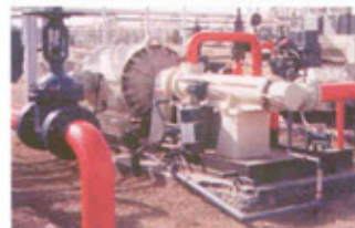
8L and 12D series pumps in crude oil service - Alberta, Canada