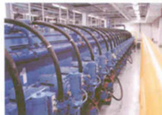
CIG series pumps in hydraulic service - Detroit, Michigan, USA