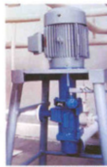
Vertical, Magnetic Drive 3D-250 pump on chemical service - Freeport, Texas, USA