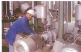
ALLHEAT® series pump in heat transfer fluid service - Germany